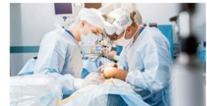
Designing Next-Gen Implants for Innovative Spine Surgery