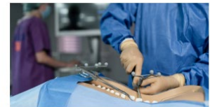
Capitalizing on the Growth of the Outpatient Spine Market