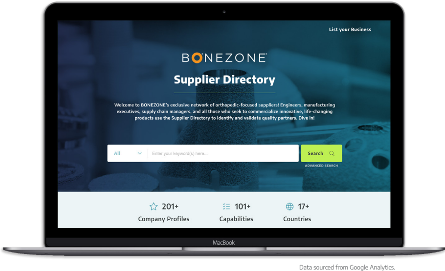
Data sourced from Google Analytics.

Orthopedic OEMs use the directory to identify and validate new suppliers.